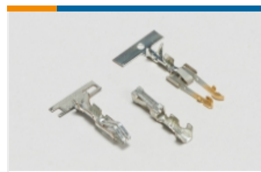
Board-to-Board Connector Contacts (104)